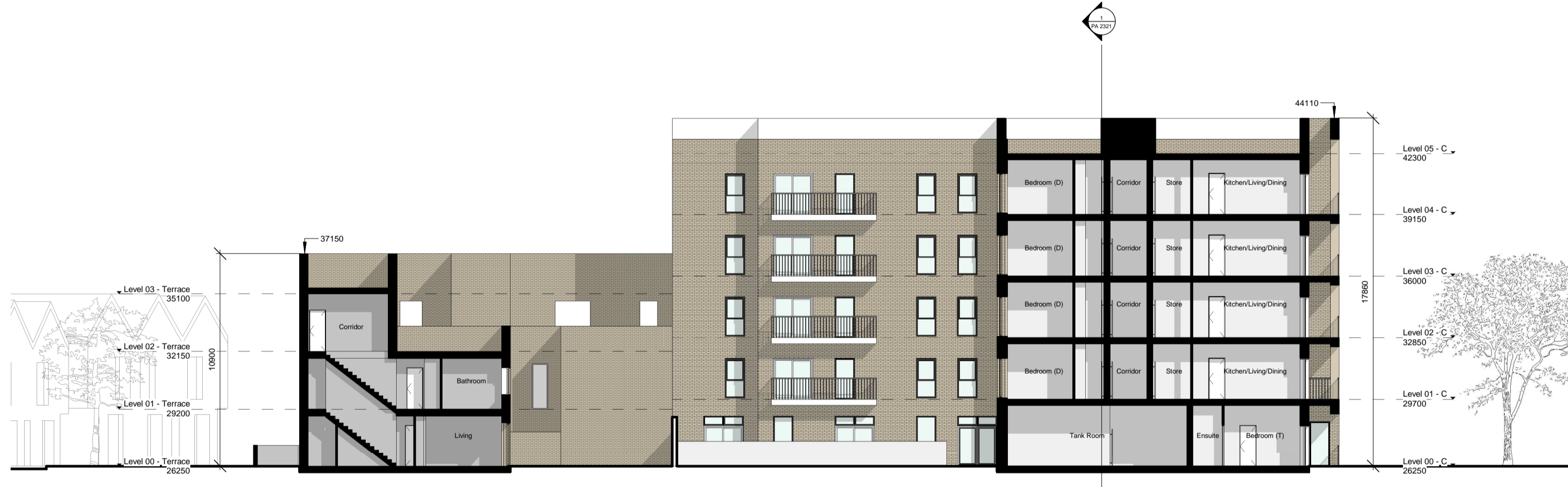
3 Block BC - Section 03 1 : 200