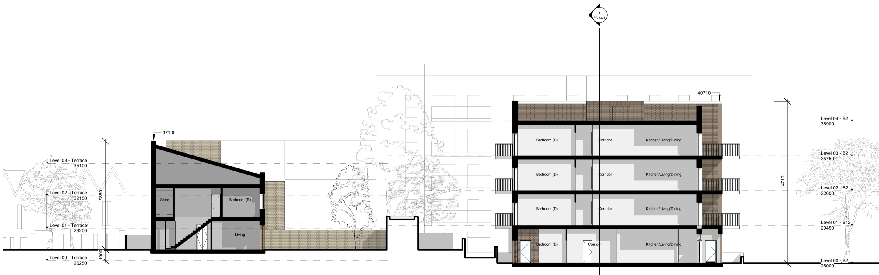
2 Block BC - Section 02 1 : 200