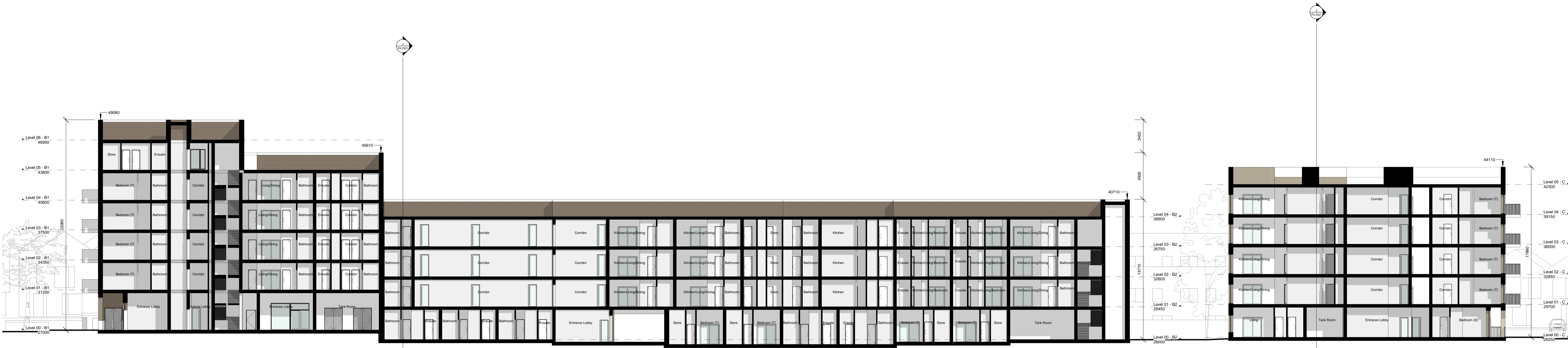
1 Block BC - Section 01 1 : 200